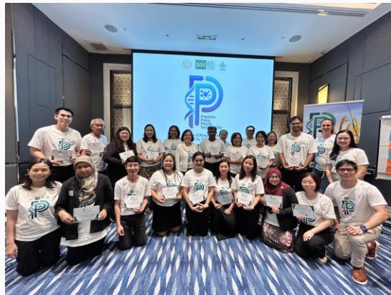
Participants of the Genome Editing Workshop in Bangkok, Thailand

The goal of the workshop was to discuss the potential of innovative genome editing technologies and their potential in agriculture, such as climate change, food insecurity, and emerging crop disease challenges, as well as share the regulatory environment in Asia. GSG's presentation included information on its programs, such as the Plant Breeding Innovation Management Program , Quality Management Systems, Incident Response, and Third-Party Management.